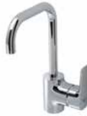
Basin mixer with high spout