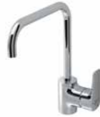
Kitchen mixer with high spout