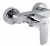
Single lever shower mixer exposed