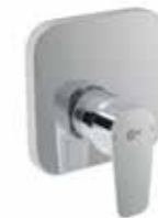
Shower mixer built-in kit 2