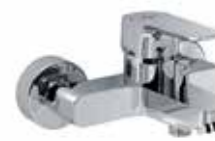
Bath and shower mixer exposed