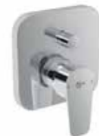
Bath and shower mixer built-in Kit 2