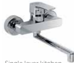
Single lever kitchen mixer exposed