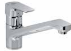
Single lever kitchen mixer cast spout