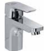
Basin mixer GRANDE